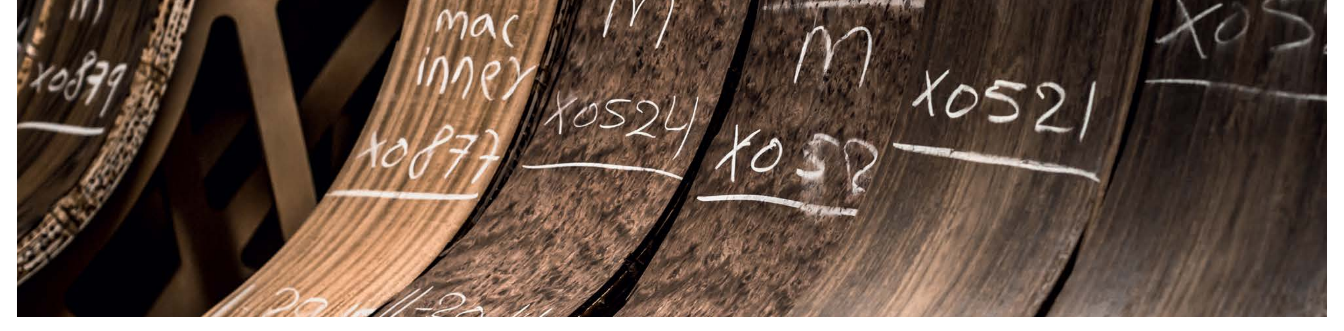
The Family OF STEINWAY-DESIGNED PIANOS