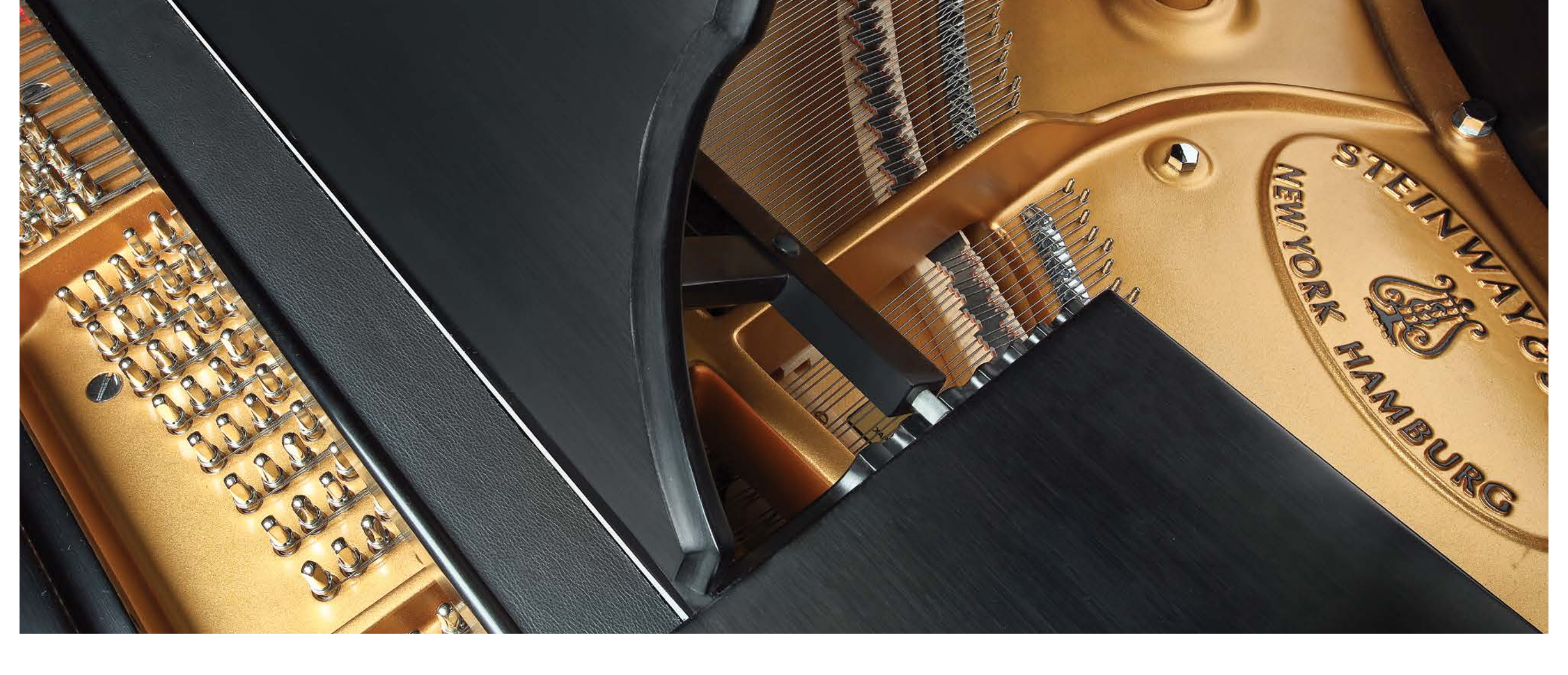
"There is a constancy, not only with the house of STEINWAY, but with their beautiful pianos."